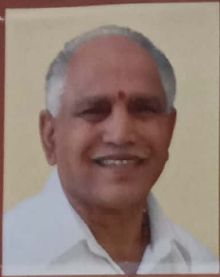
Shri B.S. Yediyurappa Hon'ble Chief Minister

An Integrated State Scholarship Portal (SSP) is developed by Center for e-Governance, GoK for sanctioning of Post-Matric Scholarship under various Schemes of Government of Karnataka. SSP does Direct Benefit Transfer into Aadhar seeded account of the student.